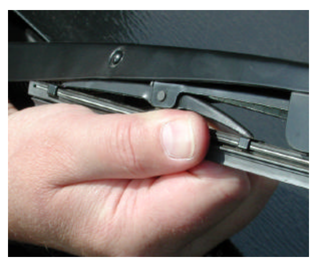
13. Apply pressure to insert to pull it past the first notch.