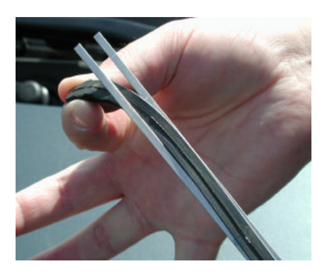
5. With insert completely removed from the wiper arm separate reinforcing strips from rubber material