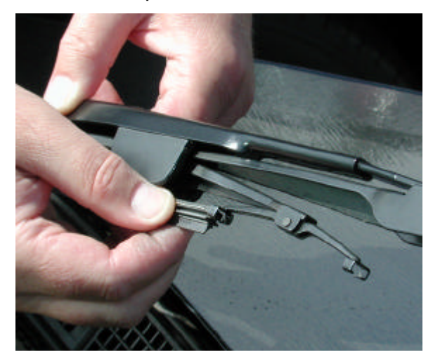
11. Continue sliding through all notches on wiper blade.