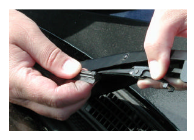
10. Slide insert through notches at bottom of wiper blade.