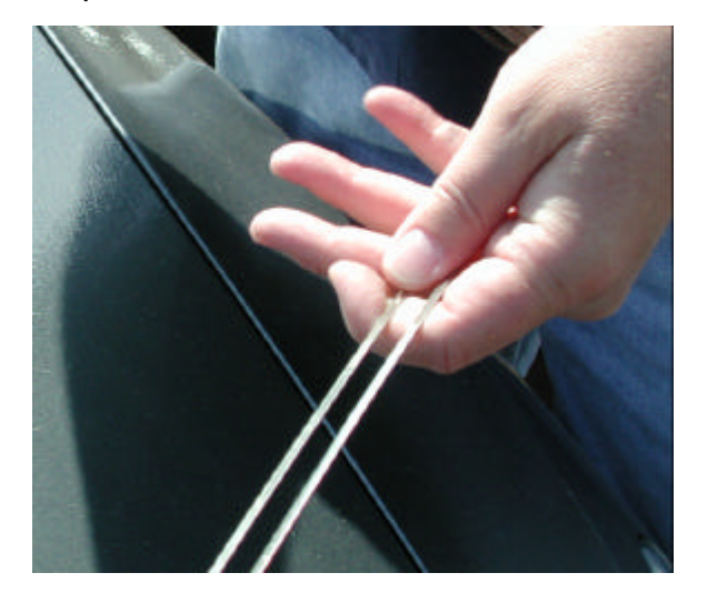
6. Discard rubber blade material and keep the two reinforcing strips