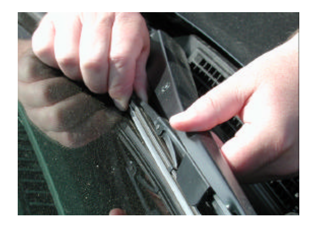
2. Grasp Bottom of Wiper Insert