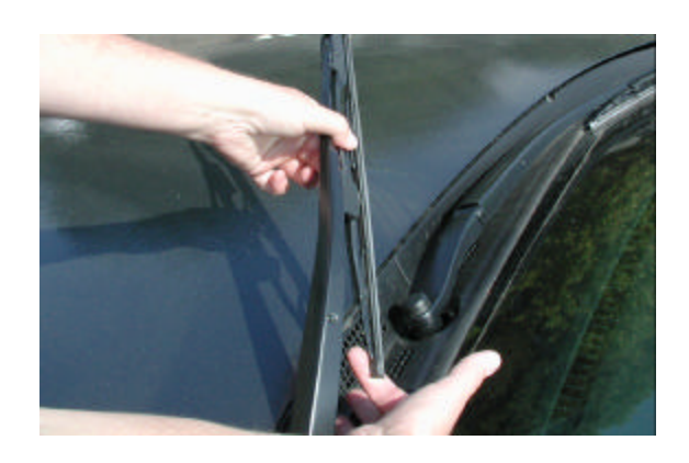
1. Lift wiper away from Windshield