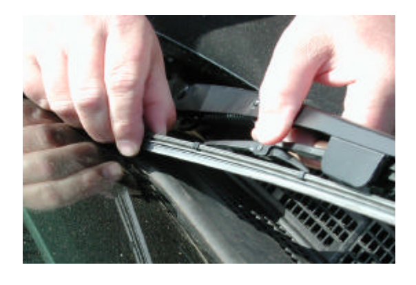
4. Once wiper insert releases from bottom of wiper arm slide insert out assembly