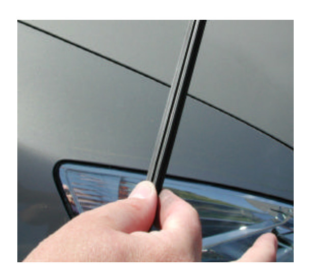
9. Repeat procedure for second reinforcement strip.