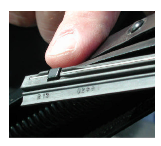
14. Insert is secured when notch on wiper arm is between the two raised areas on the insert.