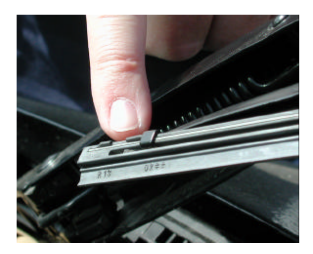
12. Blade will stop sliding near the end. where the locking notch is.